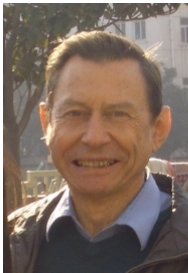
Thor, December 2009

Personal Details: Australian ; born 8 September 1945; male, 168 cm, 68 kg, single, very fit and active (distance running for over 50 years).